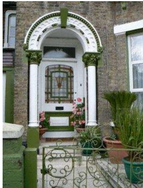
Brian Adams house as we saw it from our tour bus.

Obviously our tour guide played us one of his songs.