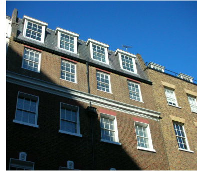
Rooftop of the Apple Corp

Just a few miles from the Vigo Street away there were shown lots of musicals, which I found very fascinating.